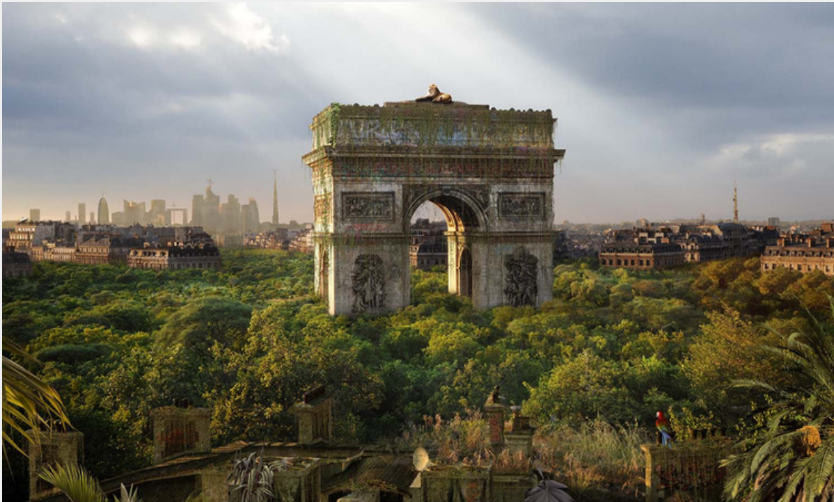
Paris, Arc V - 2018 Fujiflex Crystal Archive - tirages 7 ex.