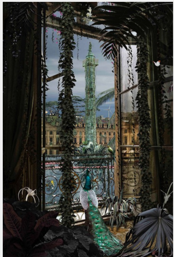
Paris, Place Vendôme Ritz Suite Premium – 2020 Fujiflex Crystal Archive – tirages 7 ex.

Today, he presents us with a continuation of his inside views of the city .