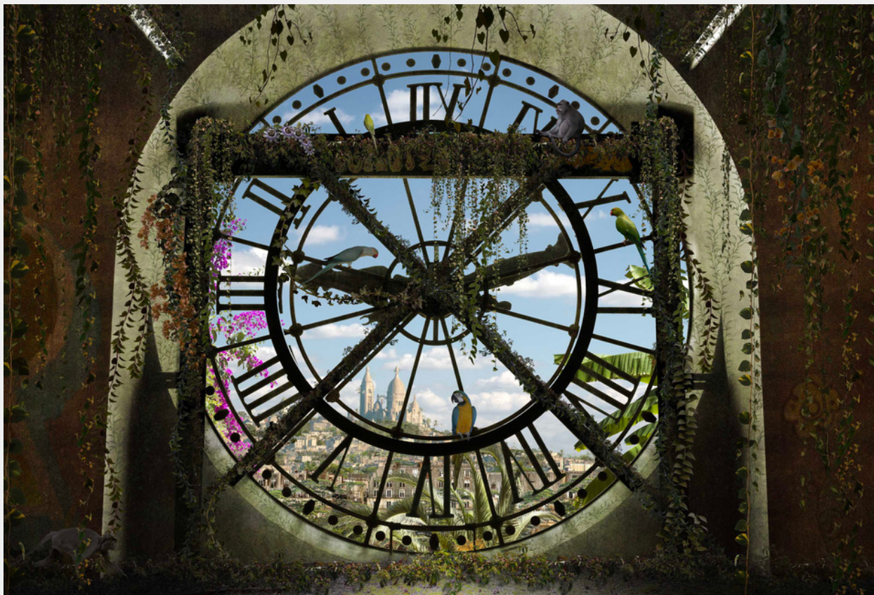
Paris, Musée Orsay Green Time - 2024 Ilford Gloss - tirages 7 ex