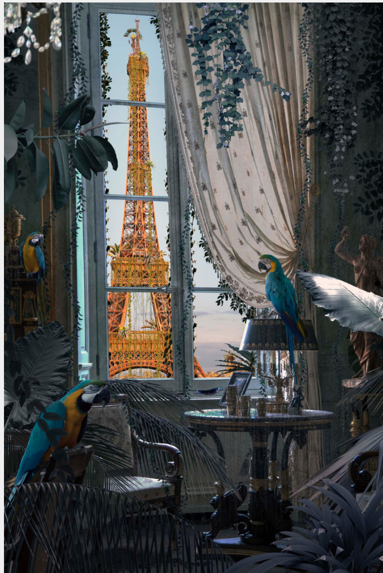
Paris, Fenêtre sur Tour - 2024 Ilford Gloss - 7 tirages - limitée 7 ex

Exhibition from Monday March 25 to Saturday April 20, 2024