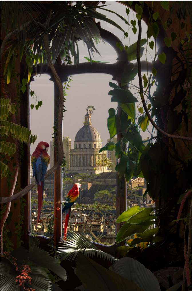
Paris, Panthéon Des Perroquets et des Grands Hommes Ilford Gloss - tirages 7 ex. - 2024

Selection of historic works already produced, on baryta paper, on Fujiflex Crystal in Diasec, in backlit light boxes, under special conditions.