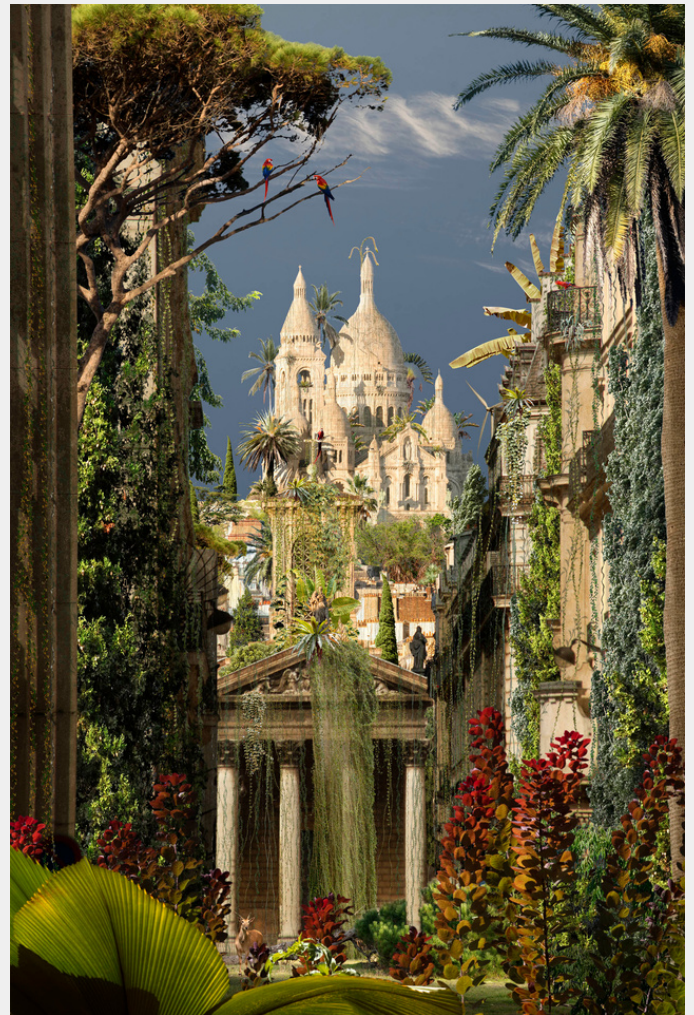
Paris, Montmartre Butte Magique - 2023 Ilford Gloss - tirages 7 ex.